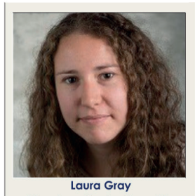
New Investigator Award in Public Health